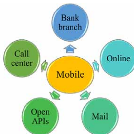
Fig. 3. Banking model of the future

High-tech user platforms are designed to help banks cross-sell paid services more efficiently. Using data lakes in banks to store customer information will allow sales professionals to receive the necessary information using a digital interface right at the meeting with a client. These digital tools, which provide access to data from adjacent business units, can enable junior bank employees to work directly with customers without involving more experienced colleagues, and also reduce the number of participants in the service delivery process. All this, in turn, will allow banks to reduce operating costs.